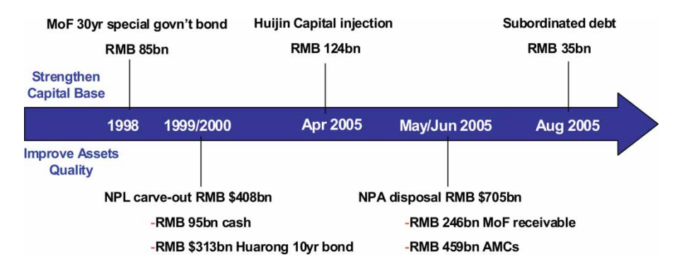
Figure 2. Financial restructuring of ICBC.

Source: Company data, Deutsche Bank's analyst report.